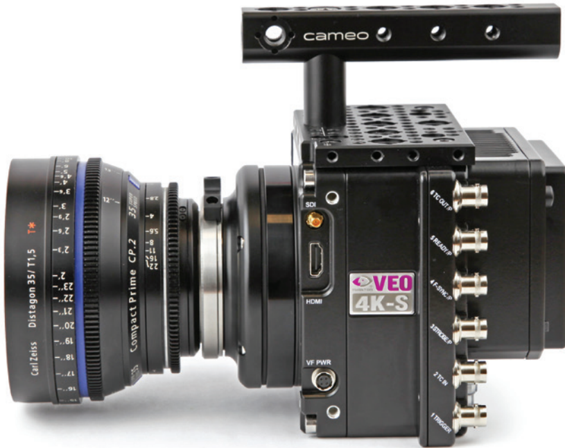
VEO4K-PL pictured with Cameo handle