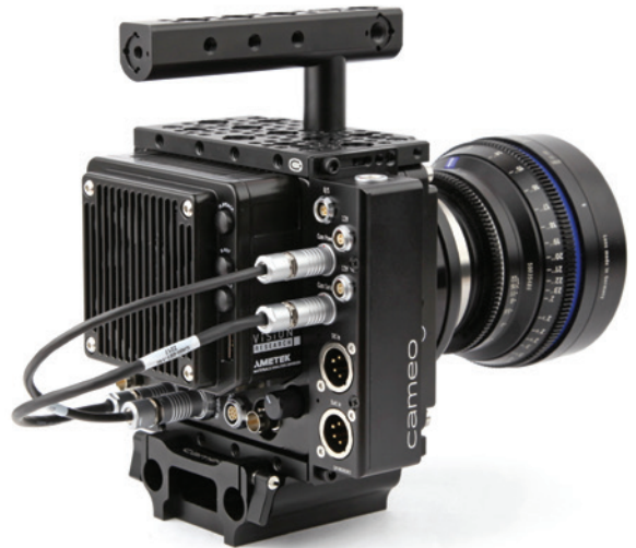
VEO4K-PL pictured with CAMEO Cine Essential kit and VEObob

Internal Mechanical Shutter: Activate to perform a black reference or protect the sensor while changing lenses. No physical access to the camera is needed.