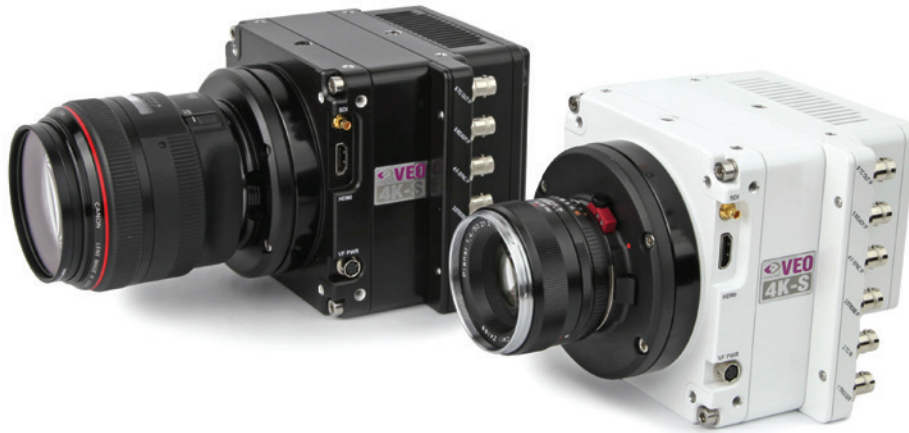
VEO4K-PL (left) and VEO4K-990S (right)

Rugged Design: Milled out of aluminum with electronics isolated from airflow.