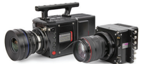
The VEO4K can be considered a smaller, lightweight version of the Flex4K-GS. Some of the differences: